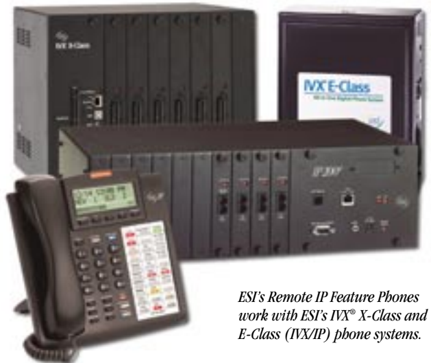
ESI's Remote IP Feature Phones work with ESI's IVX® X-Class and E-Class (IVX/IP) phone systems.

Temporary field offices — If your company periodically establishes temporary remote office locations with a data connection to the main office, now that same data pipeline can also carry your interoffice phone traffic. Simply program the Remote Phone and plug it into the field office's high-speed data connection, and you've got a fully-functional extension for as long as you need it. Down the street or hundreds of miles away, your field offices can be as accessible as the person in the next room.